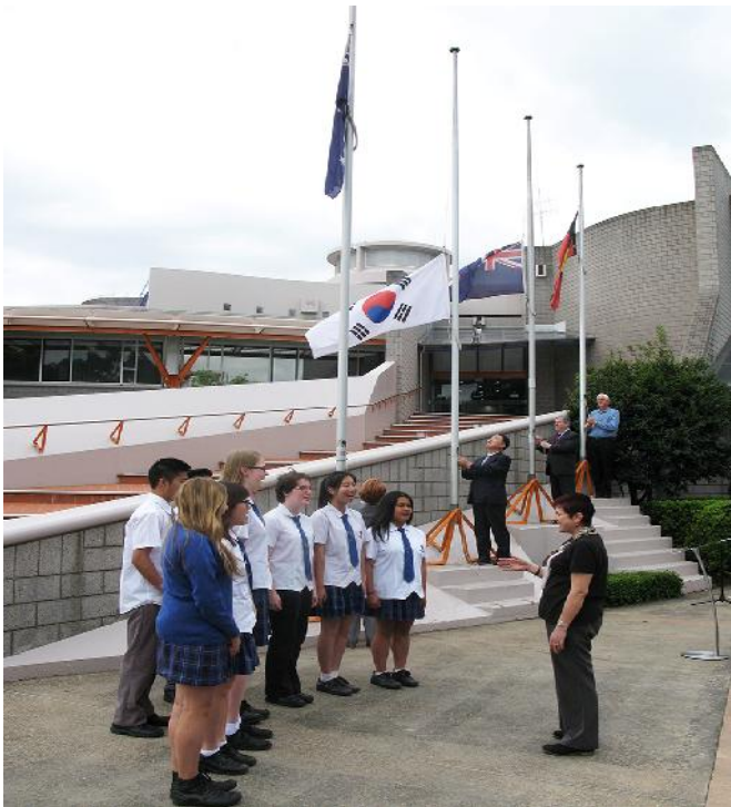
Flag raising Ceremony at Penrith Council